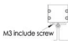
M3 include screw

1、Drill two holes in the wall or floor according to the hole size of the support, and put glue plugs or wood blocks into the holes.